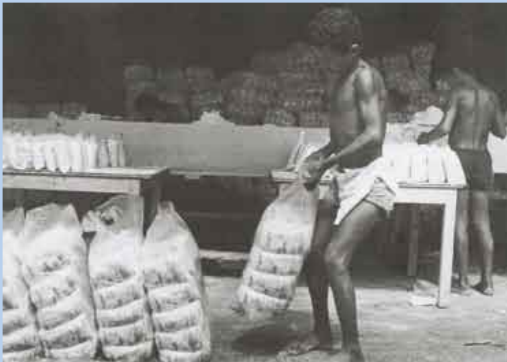
For most working children in the developing nations, their work is better called 'labour': It is not meaningful and they did not choose it.